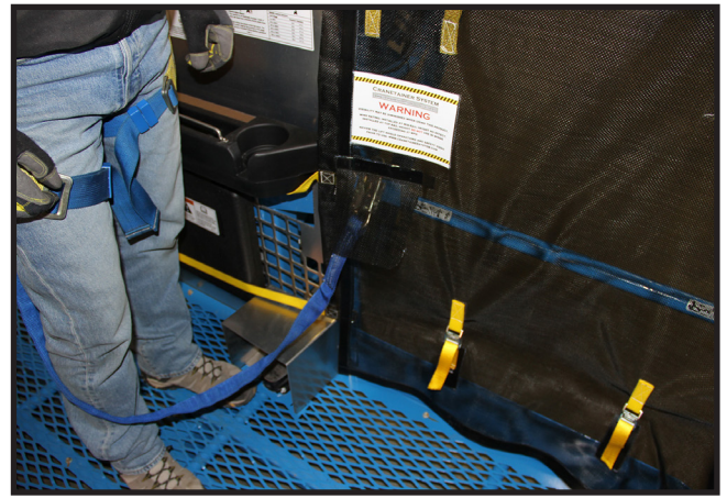
The Lift Shield has access points for lanyard attachments.