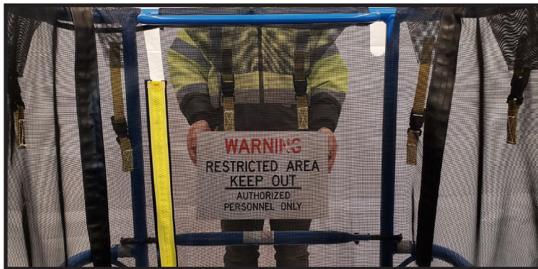
The material used is 65% open air, which allows for high visibility.