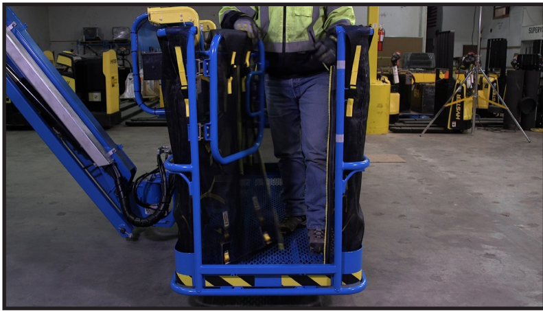
The Lift Shield has two side entry openings and one front entry opening that work with both swing gate entries and slide gate entries.