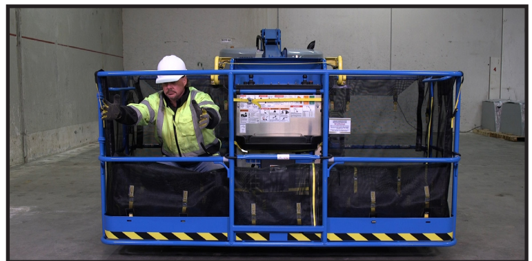
The top of the Lift Shield can be lowered to allow workers access to perform tasks in between the top and mid rail. This can be done in small or large sections of the Lift Shield.

For wholesale orders and more information call Genie (877) 367-5606 or visit gogenielift.com