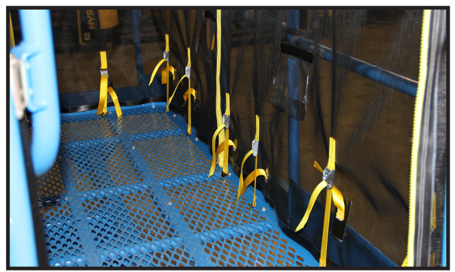
The Lift Shield tensioning straps can be attached to the basket floor in older basket models. It has separate accessories to accommodate different toe kick designs and basket configurations.